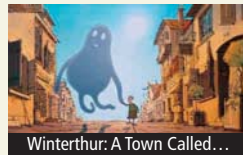
Winterthur: A Town Called...