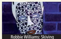
Robbie Williams: Skiving