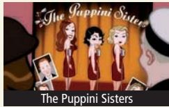
The Puppini Sisters