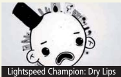
Lightspeed Champion: Dry Lips