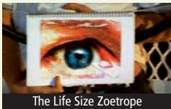
The Life Size Zoetrope