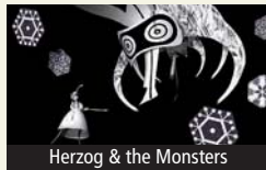
Herzog & the Monsters