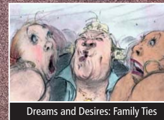
Dreams and Desires: Family Ties