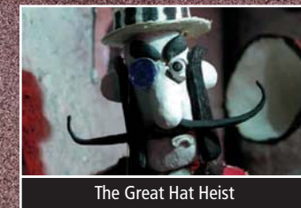
The Great Hat Heist