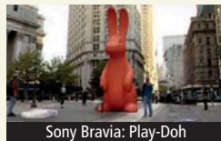
Sony Bravia: Play-Doh