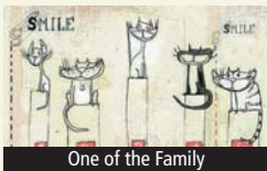
One of the Family

PSAPP: Hi In their studio at night, a bizarre menagerie of creatures made from hearts of the internal workings of their and instruments, come alive and perform. | Trunk | Trunk Animation | 3:50