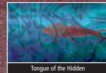
Tongue of the Hidden