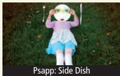
Psapp: Side Dish