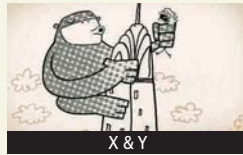
X & Y