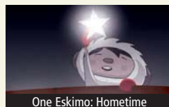
One Eskimo: Hometown