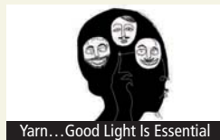
Yarn... Good Light Is Essential

Fujiya Miyaki: Ankle Injury Growing up in the 80s: football, gymnastics, playgrounds, computer games, fireworks,