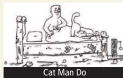
Cat Man Do