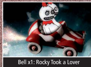
Bell x1: Rocky Took a Lover